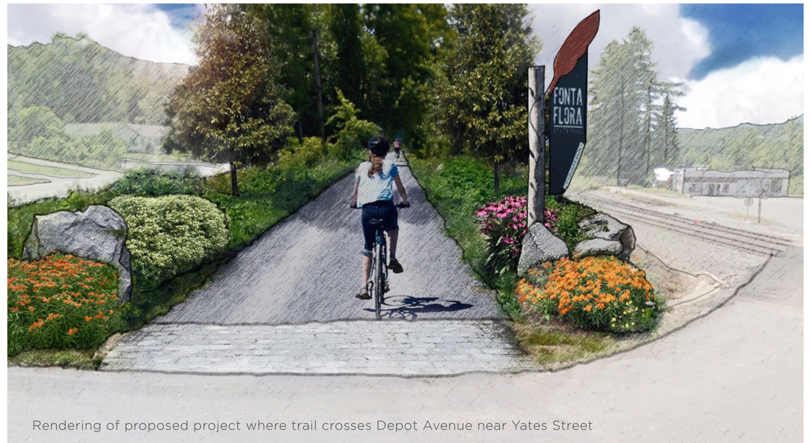
Rendering of proposed project where trail crosses Depot Avenue near Yates Street