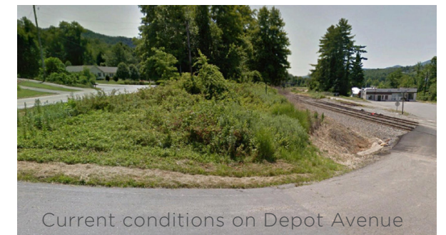
Current conditions on Depot Avenue