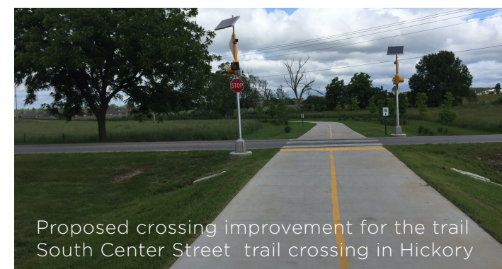
Proposed crossing improvement for the trail South Center Street trail crossing in Hickory

The Wilderness Gateway State Trail Plan indicated there is public support for this section.