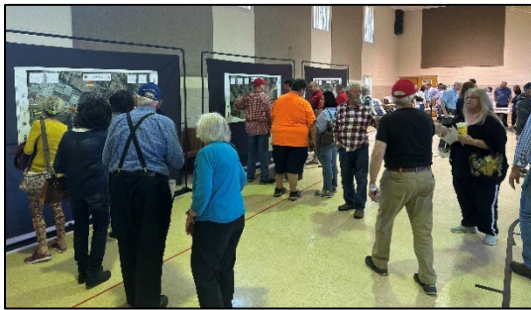
Residents Discussing the Preferred Design Alternative with the Project Team

The Public Meeting was held from 5:00 PM to 7:00 PM in an open house format where attendees could stop by at any time to review materials and ask questions. Upon entering the meeting, attendees were asked to sign in and were given a handout with project information and a comment form. The meeting handout included an overview of the project, the preferred alternative, proposed typical section, and other relevant project information.