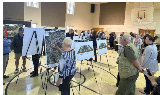
Traffic Board and Typical Sections

Attendees were invited to provide comments on any aspects of the proposed project. A total of 29 comment forms were received from 150 attendees at the meeting. An additional 63 comments were received via mail, email, or phone during the public comment period. The following is a general summary of the comments received.