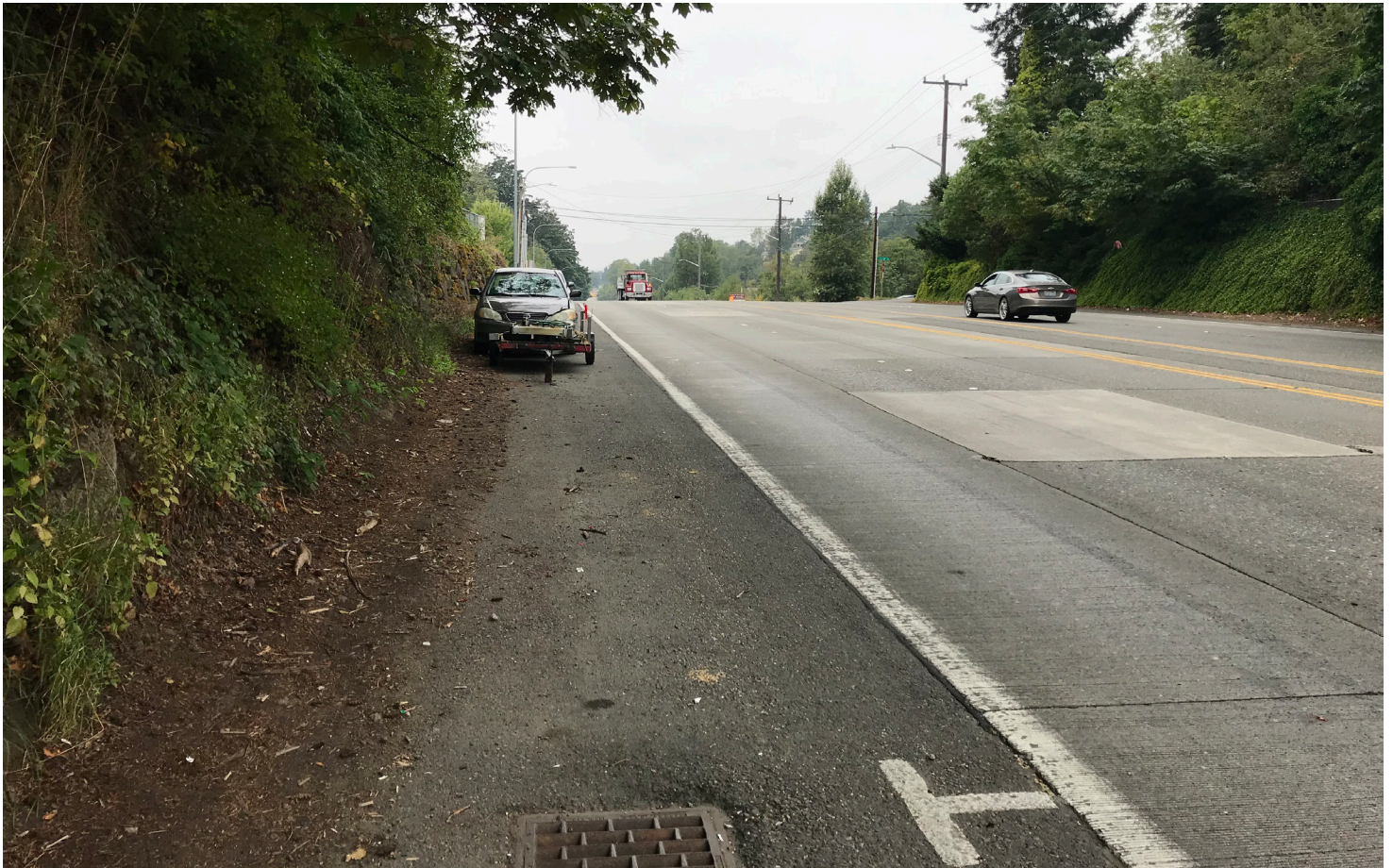
Heavily-traveled SR 900 has limited sidewalks and lacks other safety features.

Americans with Disabilities Act (ADA) Information: Accommodation requests for people with disabilities can be made by contacting the WSDOT Diversity/ADA Affairs team at wsdotada@wsdot.wa.gov or by calling toll-free, 855-362-4ADA (4232). Persons who are deaf or hard of hearing may make a request by calling the Washington State Relay at 711.