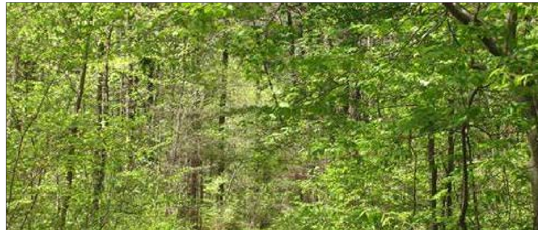
NATURE /WALKING TRAIL