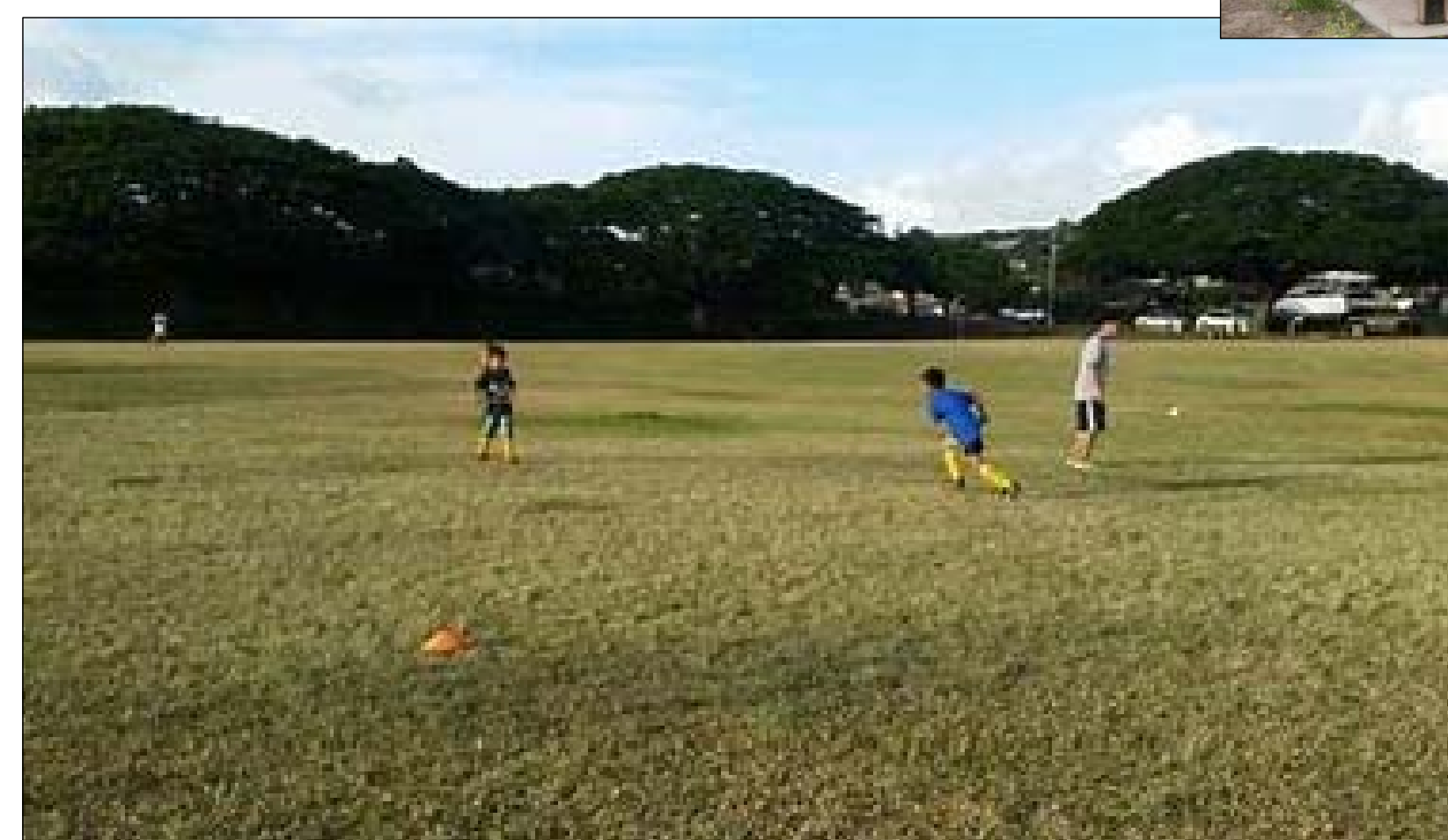
MULTI PURPOSE FIELD