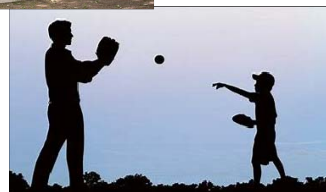
OPEN LAWN AREA