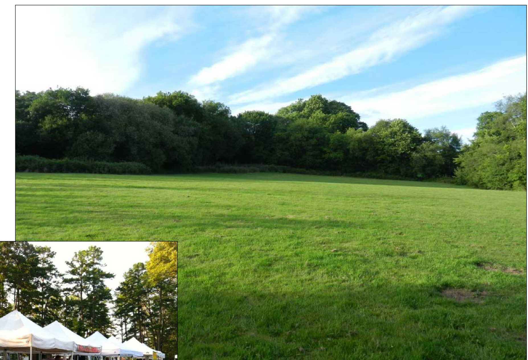
OPEN LAWN AREA