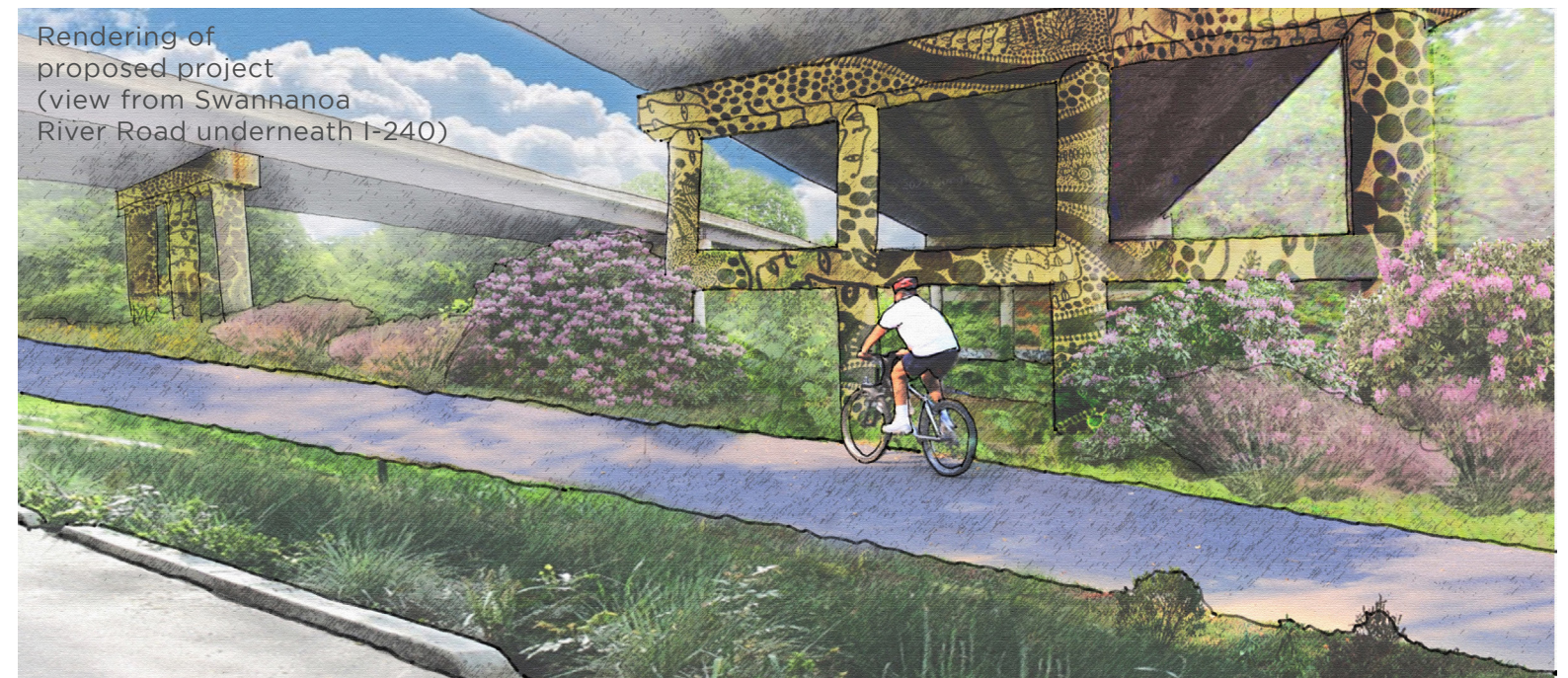
Rendering of proposed project (view from Swannanoa River Road underneath I-240)

Several options for crossing under I-240 at existing underpass: trail could go on-road with vertical separation from vehicles; however, routing the trail under the underpass separate from the roadway would make a more comfortable user experience by maintaining distance from vehicle traffic.